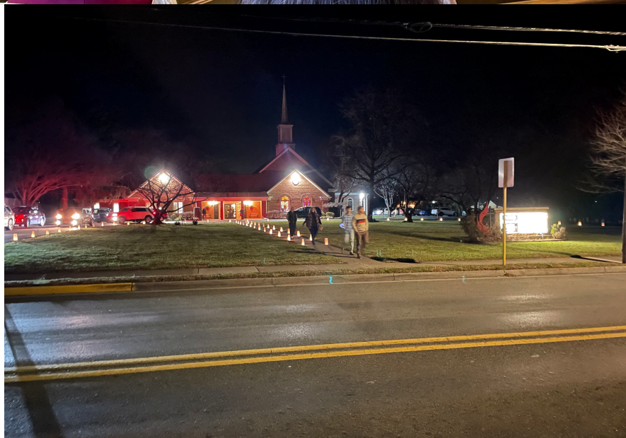
Christmas Eve 2024